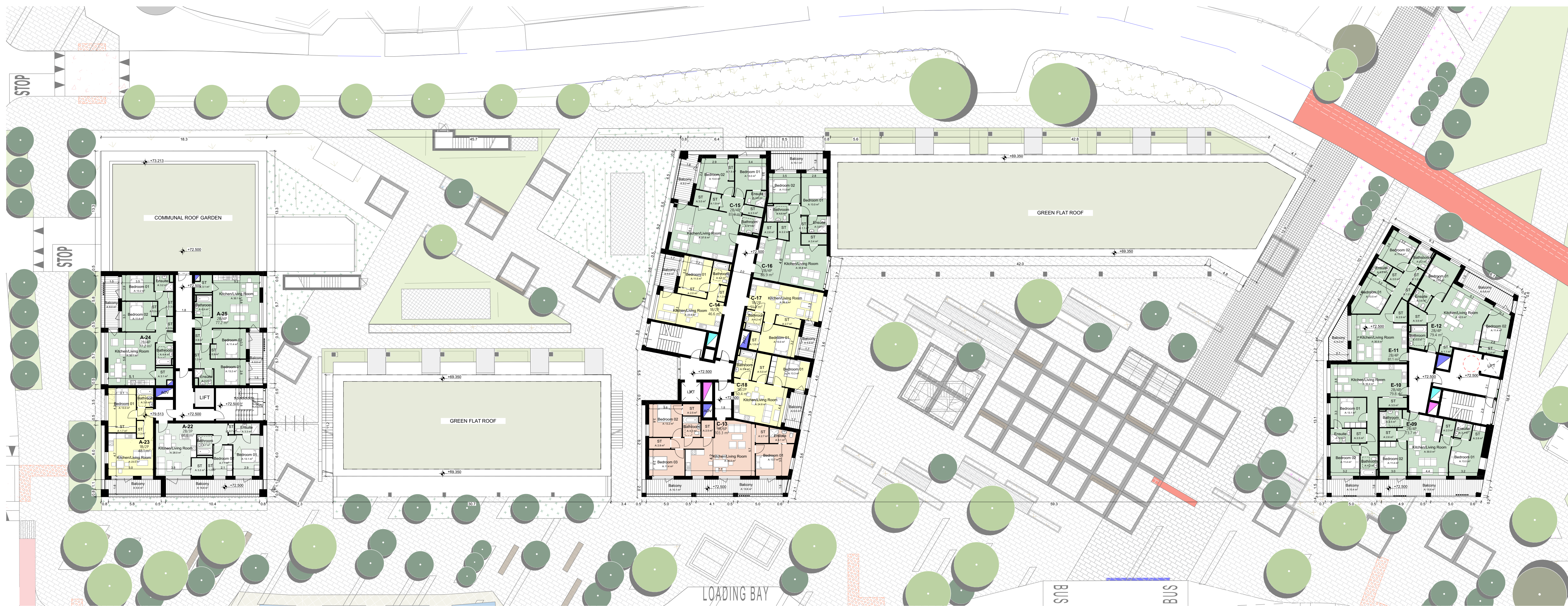
FOURTH FLOOR PLAN SCALE 1:200